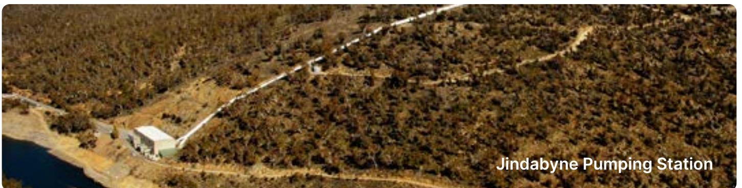
Jindabyne Pumping Station